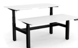
AgileMotion+ Electric Double Sided Desk