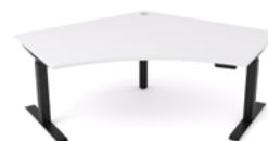
AgileMotion+ Electric 120° Single Sided Workspace