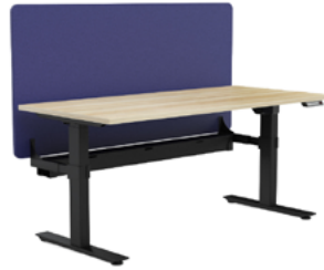
Single Motor Desk with integrated cable duct and Hung AcoustiQ Blue Screen

Cable trays - system includes desk to desk bridges, power/ data mounting points (inside the tray or on the vertical face) and cable snakes to the desktop