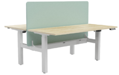
Double Motor Desk with integrated cable duct and Hung Splice Lagoon Screen